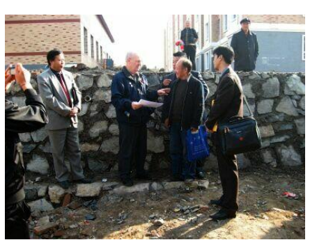
Exploring remains of the Senior Officers Camp at Liao Yuan, China