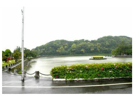
Discovery of the Taihoku POW's lake