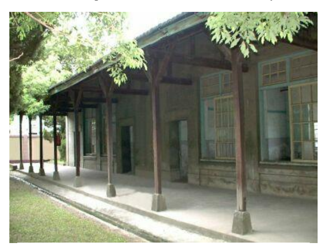
Taiwan's last POW structure - torn down in 2003

Then in November 2003 for some mysterious reason the old part of the school was torn down – what had been Taiwan's last remaining POW structure was gone! Even then we did not give up and still hoped to erect a memorial on the school grounds to remember the 294 American POWs off the hellship Hokusen Maru who were in the camp from November 1944 to January 1945.