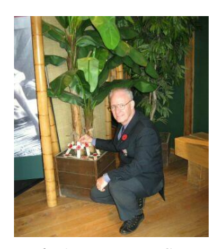
Placing a Poppy Cross at the COFEPOW Museum in memory of the Taiwan POWs