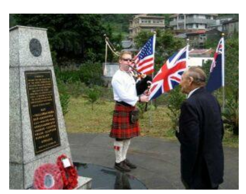
Another successful & memorable Remembrance Week event - Nov 12 - 19