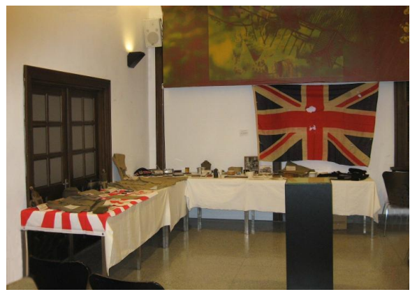
The WWII Military & Far East Prisoner of War Exhibit