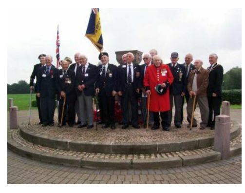
Enjoying fellowship with the POWs at the UK POW Reunion - Sep 12 - 15