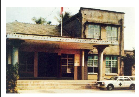
View of the front of the hospital circa 1970's

We are thankful to the Kaohsiung City Culture Bureau and the Minsheng Hospital for their help in tracing this story, and hopefully in the future we may learn even more about it and the men who were treated there.