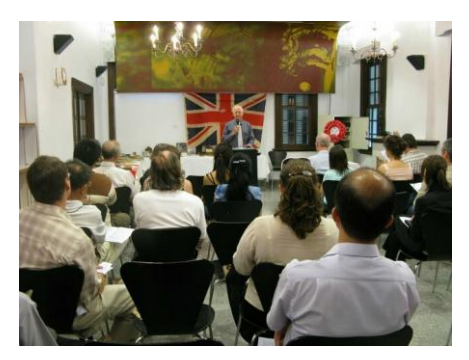
FEPOW Day - Sunday, August 10