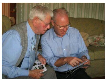
Visiting with FEPOW friends on the UK tour