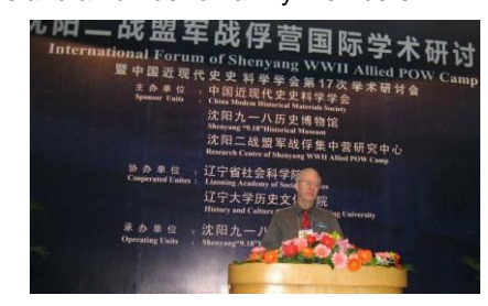
Speaking at the POW conference

The conference was good as I was able to share more of the story of the Taiwan POWs who came to Mukden in the last year of the war. While there I was honoured to be made a Research Fellow by Shenyang