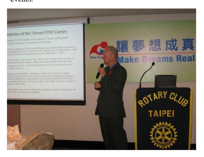
Speaking to the Taipei Rotary Club luncheon.

He thanked our club for its interest and support and said he looks forward to continuing a relationship with us and will keep us informed of upcoming projects and events