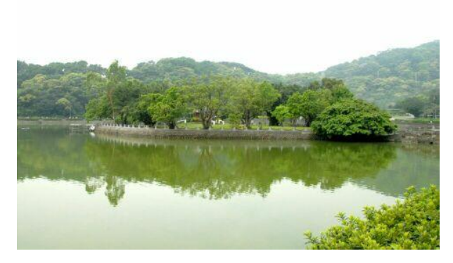
View of the POW lake with the island as it is today.

During the summer months and at the POW reunion in September, we were able to confirm this with several of the POWs in the UK who had worked on the project. It is wonderful at last to have uncovered yet another piece of the legacy of the Taiwan POWs.